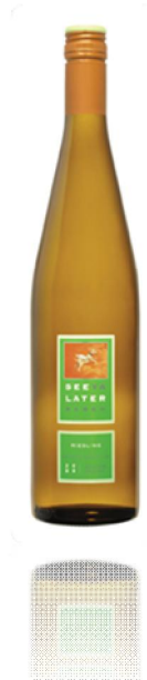
See Ya Later Ranch – BC VQA Riesling – 34.50 $