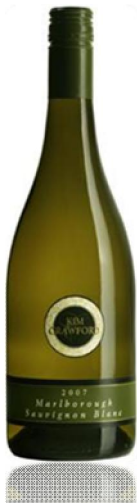
Kim Crawford Marlborough - New Zealand Sauvignon Blanc – 49.50 $